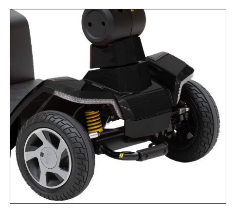
All Around CTS Suspension